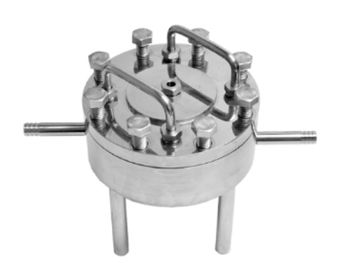
Online Liposome Extruders