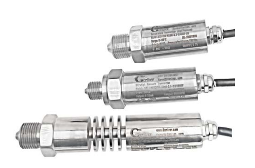
Temp. & Press Sensors