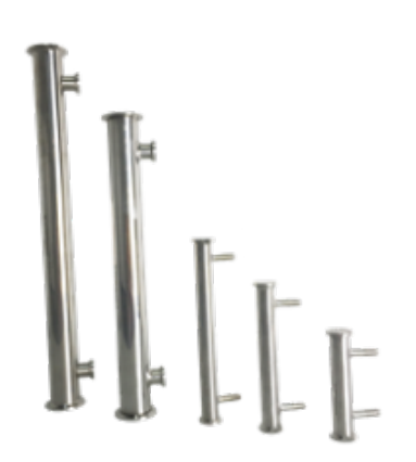
Sanitary Heat Exchangers