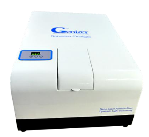
Dual-light Particle Sizer