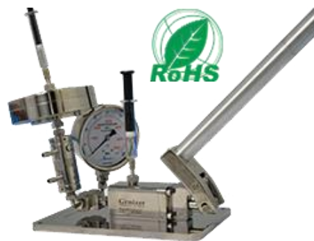
Homogenizer with Extruder